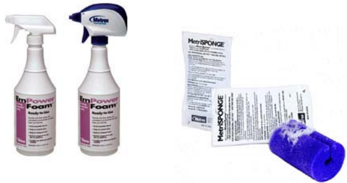
Enzymatic Cleaners - foam or sponge