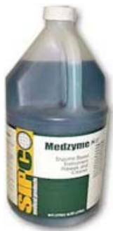
Medzyme Enzymatic Cleaner