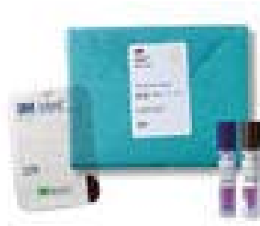
Process Challenge Device PCD or Test Pack containing BI