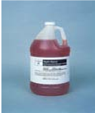
NPH Klenz Neutral Detergent