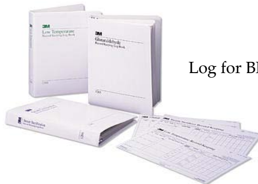
Log for BI monitoring