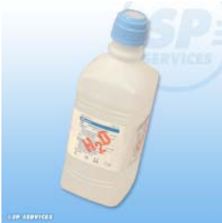
Sterile Water for Irrigation - 500ml 1000ml, 3000ml volumes

(Sterile or sub-micron filtered water is recommended )