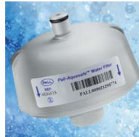
Pall-Aquasafe™ Faucet Water Filter