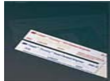
Steam/Ethylene oxide (EO)